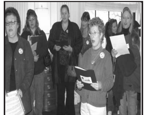
Local 170 members marched to Governor Joe's Manchin's office singing "Which side are you on Joe" in protest of the wage freeze.