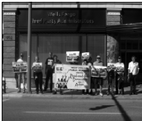
UE Local 170 members picket in front of the Wells Fargo office in Charleston

On June 23, UE Local 170 members and community allies picketed outside of the Wells Fargo office in Charleston as part of a National Day of Action in support of our brothers and sisters employed by Quad City Die Casting, a locally-owned factory in Moline, Illinois. Similar protests also took place in more than twenty cities across the country from Boston to Los Angeles.